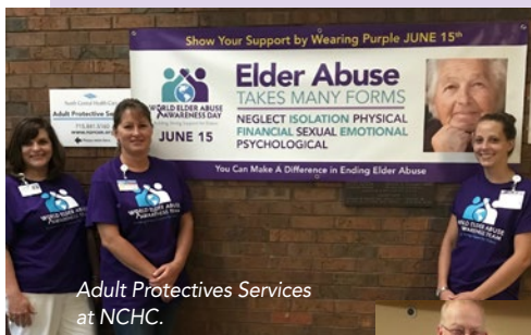
Adult Protective Services at NCHC.