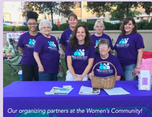
Our organizing partners at the Women's Community!