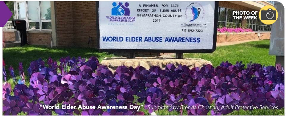
"World Elder Abuse Awareness Day"