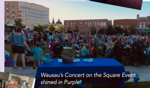
Wausau's Concert on the Square Event shined in Purple!