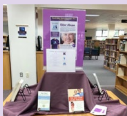
Educational Events at locations in all 3 counties.