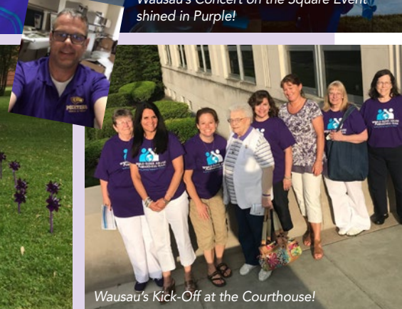
Wausau's Kick-Off at the Courthouse!