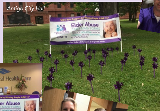
Antigo City Hall