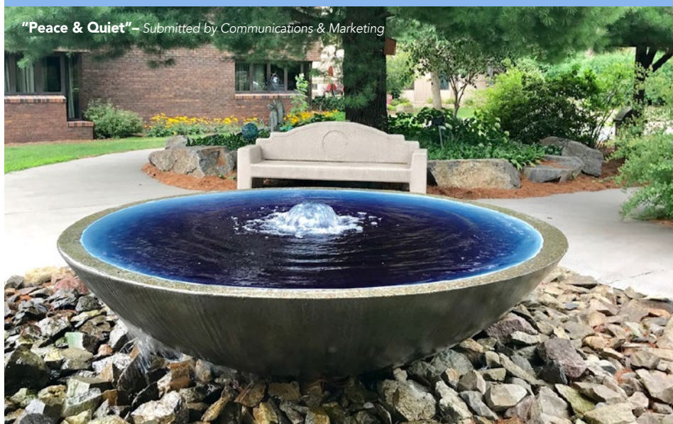
"Peace & Quiet" – Submitted by Communications & Marketing