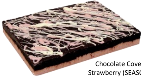
Chocolate Covered Strawberry (SEASONAL)