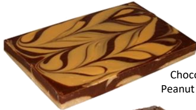
Chocolate Peanut Butter