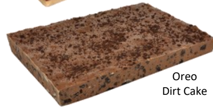
Oreo Dirt Cake