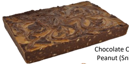
Chocolate Caramel Peanut (Snickers)