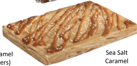
Sea Salt Caramel