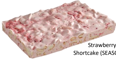
Strawberry Shortcake (SEASONAL)