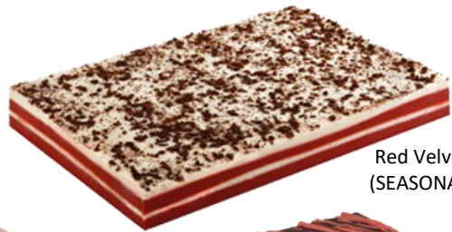
Red Velvet (SEASONAL)