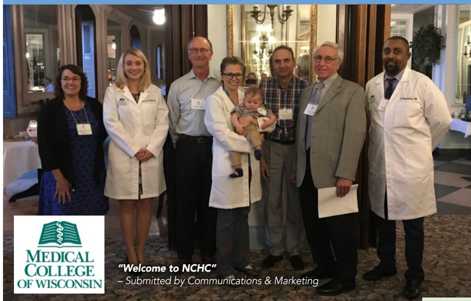
"Welcome to NCHC"