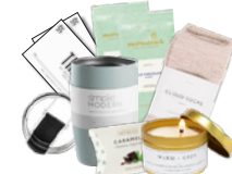
WINTER BASKET Hot Cocoa, Travel Mug, Caramels, Candle, Fuzzy Socks & $10 Bistro Bucks