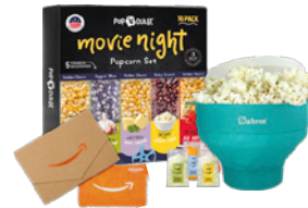
MOVIE BASKET Gourmet Popcorn Kit & Maker, $10 Amazon Movie Giftcard

Make any donation to be entered into the NCHC Drawing