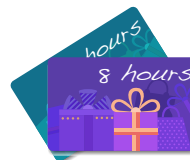
8 HOURS OF PLT 2 WINNERS