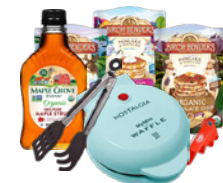
WAFFLE BASKET Gourmet Waffle Mixes, Syrup, Mini Waffle Maker & Tongs